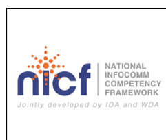
National Infocomm Competency Framework (NICEF)