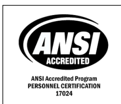
American National Standards Institute (ANSI)